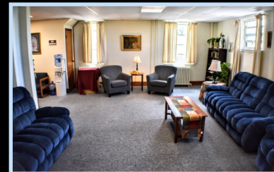
Comfortable Retreat Spaces