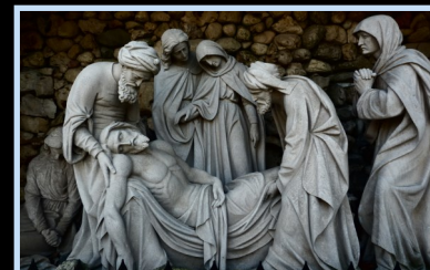
Life Sized-Stations of the Cross

Along with unparalleled peace and beauty, Holy Hill offers amenities that are ideal for group visits: