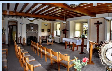
Old Monastery Inn Chapel